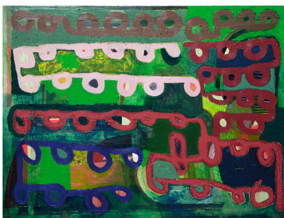
Euan Evans Gyre (2023) Oil on canvas 87 x 66 cm

10-YEAR ANNIVERSARY: ANOMIE PUBLISHING | KIMBERLEY BURROWS | EUAN EVANS | ELENA ONWOCHEI-GARCIA | HEIYI TAM