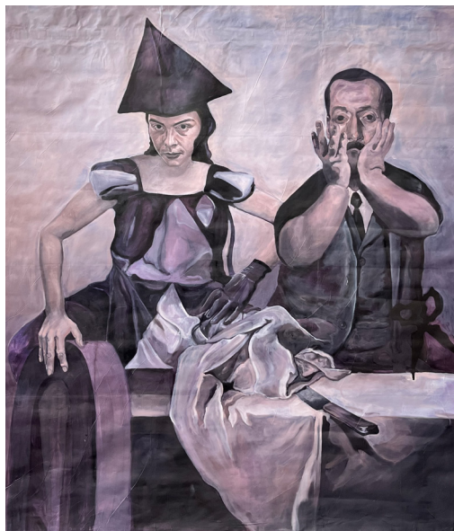
Elena Onwochei-Garcia Dramas de Honor: Actors Cutting Ties (2023) Oil and tempera on washi paper 170 x 160 cm

Heiyi Tam's vibrant canvases invoke intimate memories, ancient Chinese landscapes and calligraphy, and synesthesia around food and nature. Through the medium of painting, Tam reflects upon memories, emotions, and moments in time, exploring sensations beyond the visual language. Her work offers snippets into the past, investigating the unconscious and the relationships between the real and the imagined.