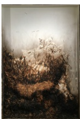
Nicholas de Jasay Matchsticks II , 2010 Matchsticks on wooden table 184h x 122w x 11d cm