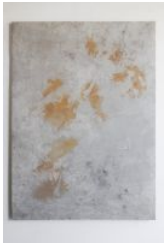
Ruben Brulat Pied gauche qui traverse et tombe dans l'eau qui boue , 2016 Mixed media on cotton 200h x 145w cm