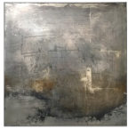
Max Maxwell The Mirror , 2012 Mixed media on aluminium 50h x 50w cm