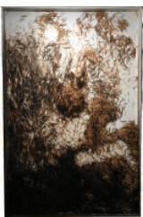
Nicholas de Jasay Matchsticks I , 2010 Matchsticks on wooden table 184h x 122w x 11d cm