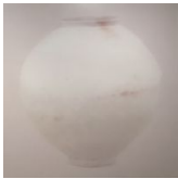
Sunghoon Yang Memory , 2015 Oil on canvas 130h x 130w cm