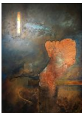
Max Maxwell Gulf , 1990 Mixed media on canvas 184h x 131w cm