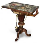
Steve Caplin Matisse , 2017 Wood, brass and artist's materials 78h x 73w x 43d cm