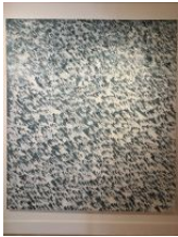
Neil Raitt Alpine , 2013 Oil on canvas 240h x 180w cm