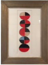
Terry Frost Construction Study , early 1960s Gouache on paper 67h x 22.50w cm Framed: 96h x 71w cm