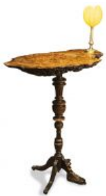
Steve Caplin Ksenia , 2017 wood, leather, brass, Ostrich egg 129h x 78w x 39d cm