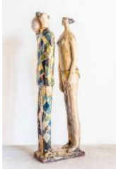
Paolo Staccioli Arllecchino e Bagnante (Harlequin and Bather) , 2016 Lustre ceramics 57h x 18w x 17d cm