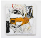
Arthur Lanyon Untitled , 2017 Oil, acrylic on panel 63 x 61 cm