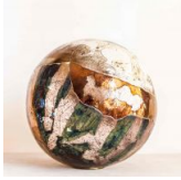
Paolo Staccioli Sfera (palla rotta)[Sphere (Broken Ball)] , 2010 Lustre ceramics 25 x 25 x 25 cm