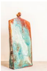
Paolo Staccioli Stele , 2002 Lustre ceramics 43 x 23 x 8 cm