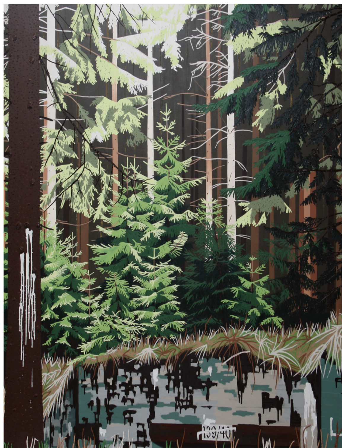
Rosie Snell, Grüne Höhle (2008), Oil on panel, 100h x 120w cm.