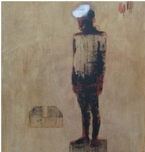
Above: Keith Roberts, The Perfect Nude II (2012), Oil on canvas, 80h x 60w cm.

Previous page: Max Maxwell, Fall 1 (2020), Mixed media on aluminium, 50h x 50w cm.