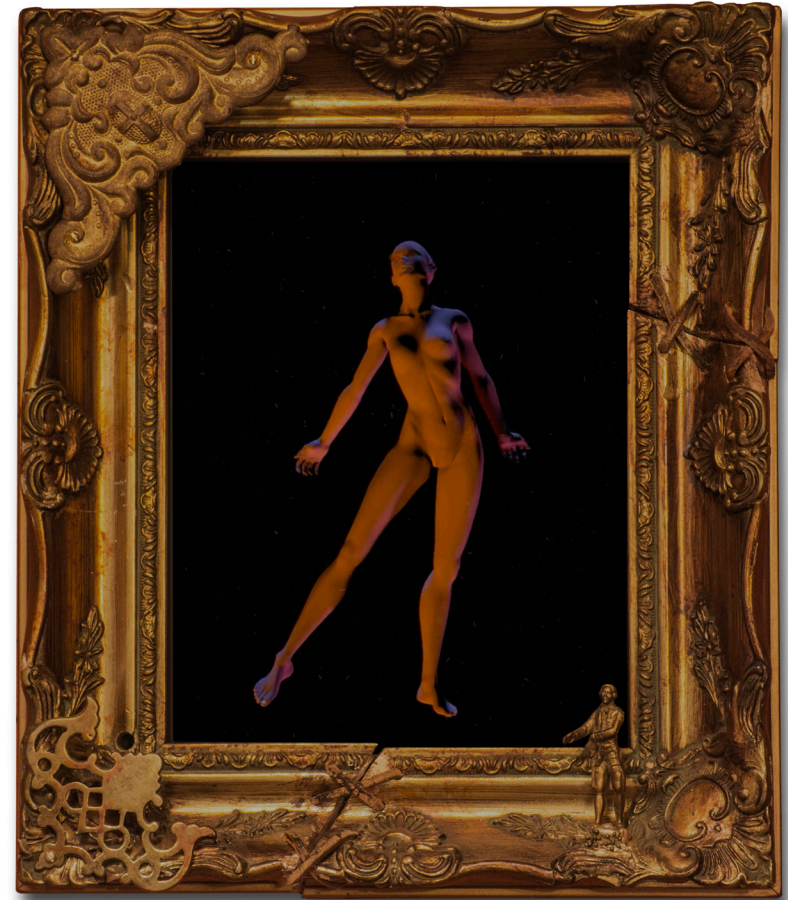
Steve Caplin, Pandora (2017), Wood, brass and digital frame, 36.5h x 31w x 9d cm.