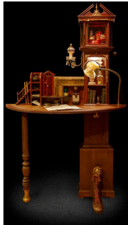
Steve Caplin, Giacomo (2020), A shoe, a finial, a leather bandage, part of a round picture frame and a drawer, 87h x 59w x 49d cm.