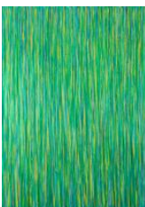
Lara Julian GY.7.8.2020.AS , 2020 Acrylic on canvas 190h x 135w cm