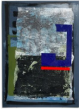
Mike Ballard Studio Snipe 2 , 2019 Oil, spray paint, acrylic, vinyl, grease proof paper and binder on card 84h x 59w cm