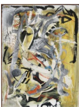
Arthur Lanyon Old Rock , 2018 Oil and acrylic on panel 62h x 46w cm