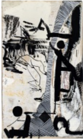
Arthur Lanyon Ears & Curls , 2016 Oil, acrylic and marble dust on panel 57h x 34w cm