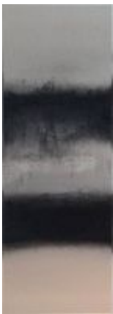
Max Maxwell Frontline I , 2017 Resins and oils on aluminium 70h x 25w cm