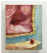
Xu Yang Bad Apple 12082020 , 2020 Oil on linen 36.50h x 29w cm