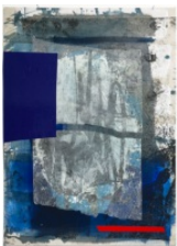
Mike Ballard Studio Snipe 3 , 2019 Oil, spray paint, acrylic, vinyl, grease proof paper and binder on card 84h x 59w cm