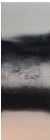
Max Maxwell Frontline II , 2017 Resins and oils on aluminium 70h x 25w cm