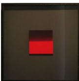
Garry Fabian Miller Red Square I.G 1 , 2004 Unique light, water, dye destruction 12.10h x 12.10w cm